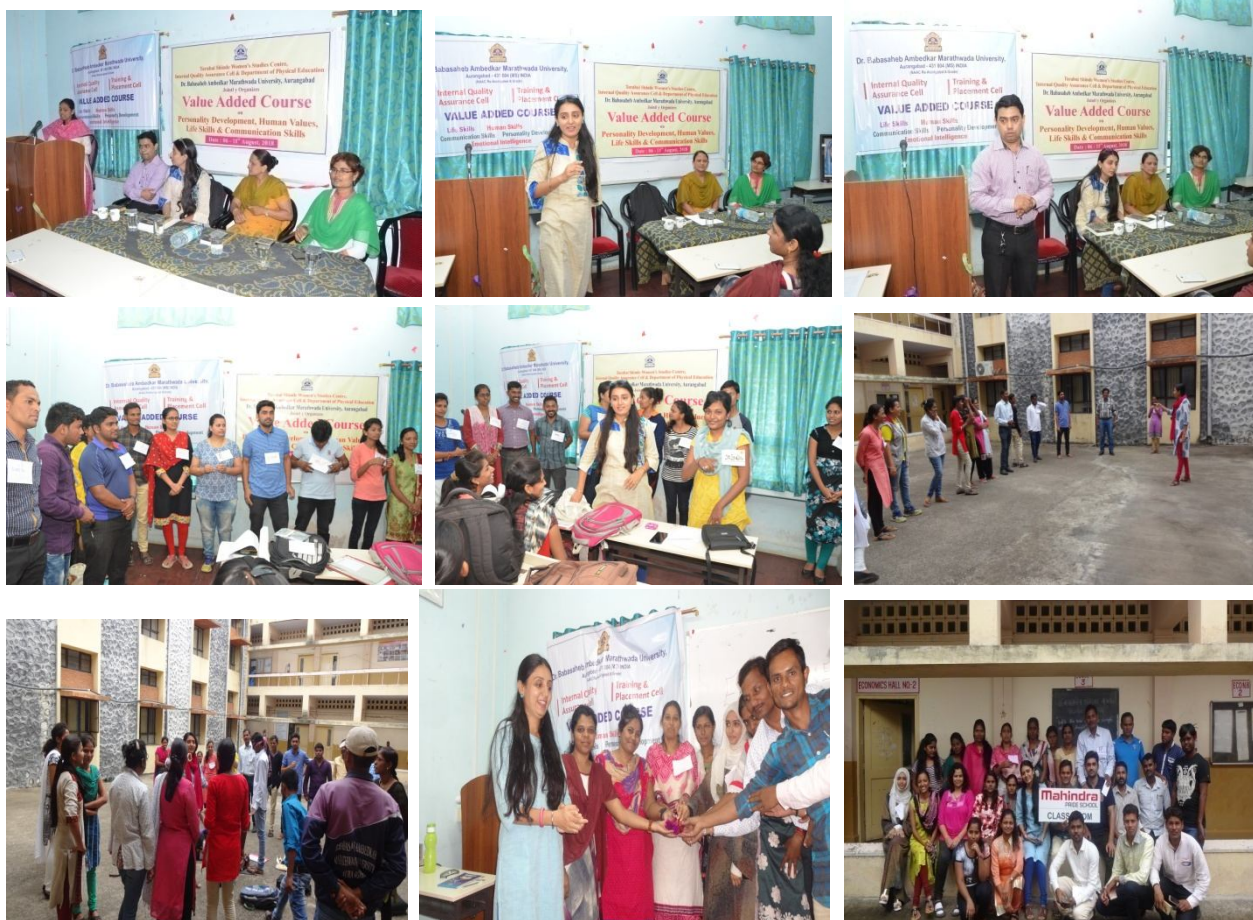
(Photos of the function inauguration, valedictory and the various activities conducted during the One Week Value Added Workshop organized at the centre)