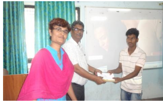
(Photos of the students critically watching the women centric movies shown at 'Friday Film Club' and the student being awarded for writing the best Film Review)