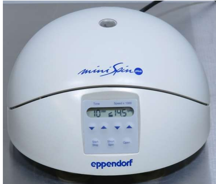
Mini Spin Centrifuge