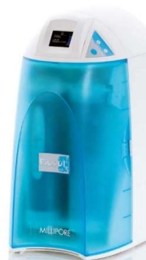
RiOs-DI Water Purification System