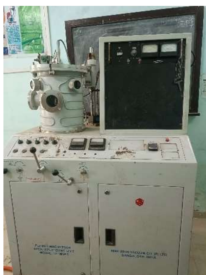
DC- Sputter coating unit