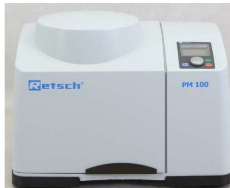
Planetary Ball Mill